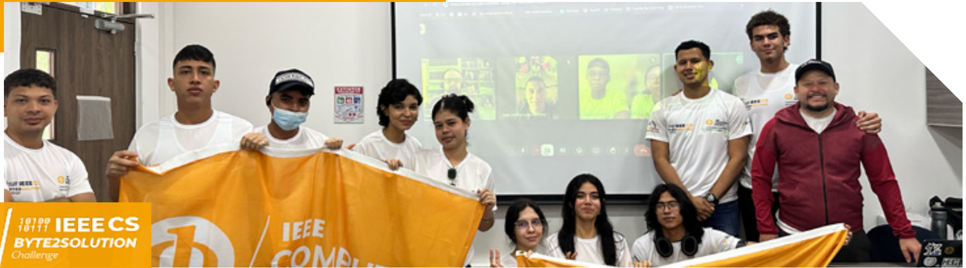
› Competitors and Judges