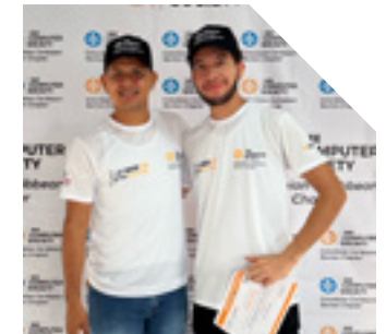
IEEE CS B2S KIC Mentors,