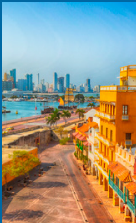
Walled City of Cartagena

Participate for great prizes at the end of the year.