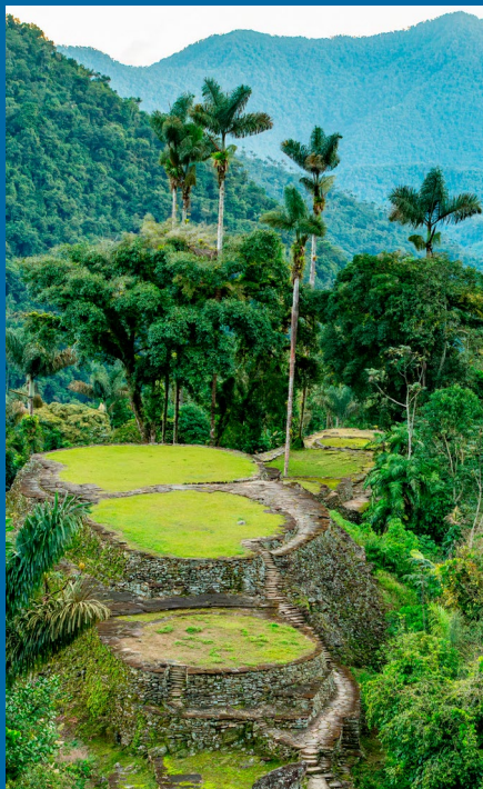
Lost City, also known as Teyuna

Participate for great prizes at the end of the year.