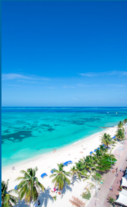
San Andres, Colombia

Participate for great prizes at the end of the year.